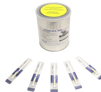
Charm SL3 Beta-lactam Test