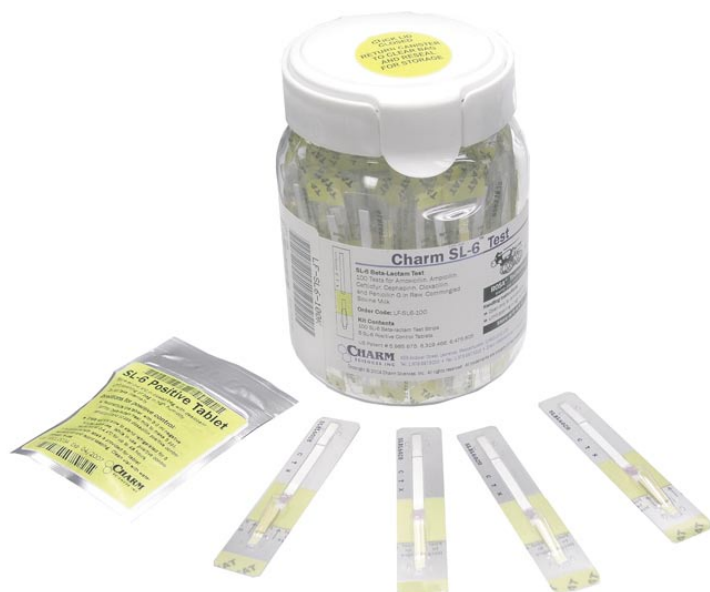
Charm SL-6 Beta Lactam Kit