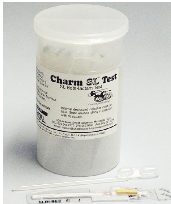
Farm 20 Beta-lactam test kit [LF-SLBL-20SUP]

The SL test is easy to use, portable and only requires an incubator. The SL accurately matches established regulatory safe levels making it the test of choice at dairy plants. Make it yours!